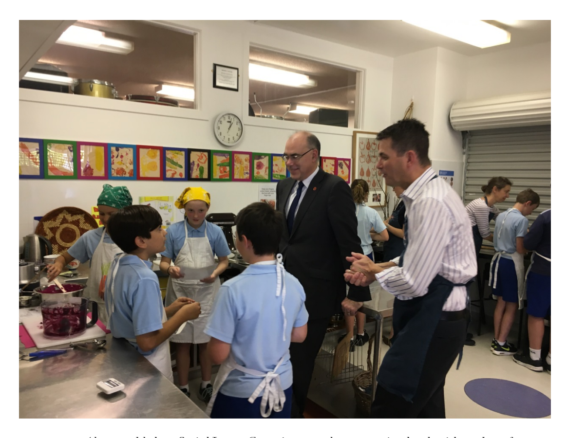
Above and below: Social Issues Committee members preparing lunch with students from Annandale Public School on Friday 21 October 2016